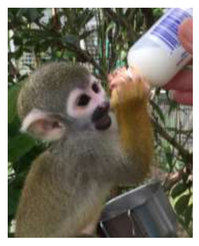
Baby Rico was still on a bottle when he arrived.

We need your help — your generous gifts make it possible for Jungle Friends to continue our mission. Please help us continue to offer loving homes to monkeys in need.