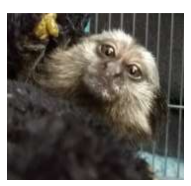
This baby was relinquished to a zoo in Indiana.

A baby marmoset also arrived — still on formula and without a name. Will you help us name her? Through the collaborative efforts of Peaceable Primate Sanctuary, Primate Rescue Center, and Jungle Friends Primate Sanctuary — the baby was transported to Gainesville on a private plane.