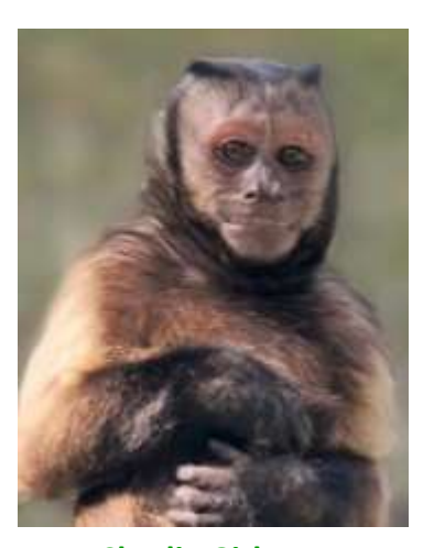
Charlie Girl was surrendered to FWC.

Charlie Girl arrived at Jungle Friends when her guardian passed. Florida Fish and Wildlife Commission (FWC) brought her to Jungle Friends. Charlie has a new monkey friend, Wanda. They play, groom, and snuggle together for a good night's sleep.